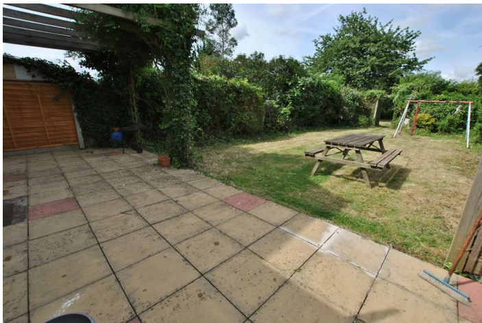
Patio area leading to lawned area