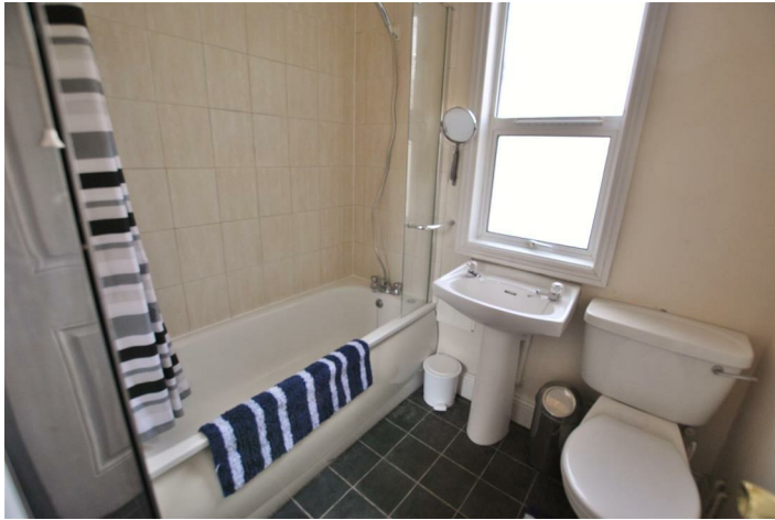
Panel enclosed bath, low level w.c. wash hand basin, window to side