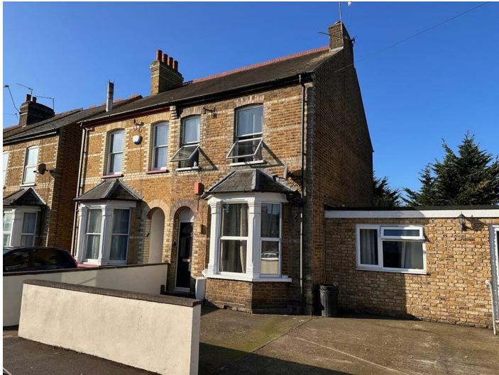
Front hard standing to front providing off street parking