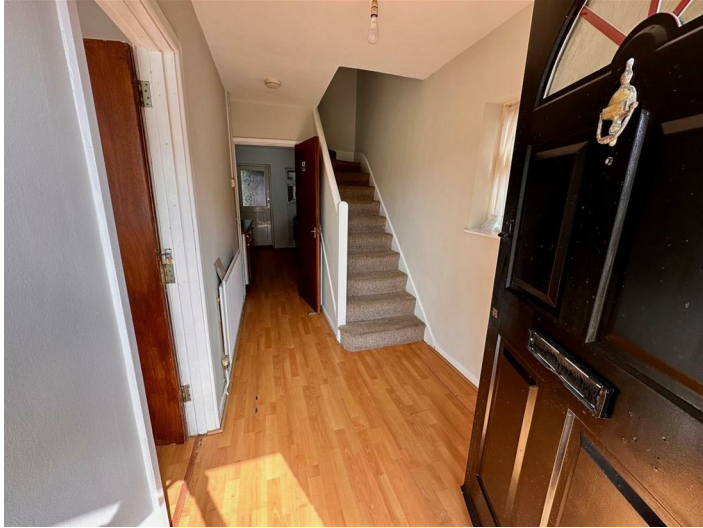
Laminate floor, radiator, understairs storage cupboard