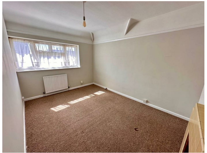
Front aspect window, radiator, storage cupboards