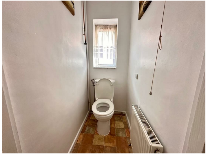
Separate Wc , window