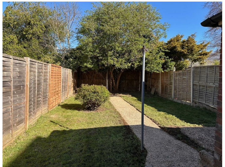
Patio area with path leading to rear of garden, lawned area, 2 brick built storage shed, outside wc