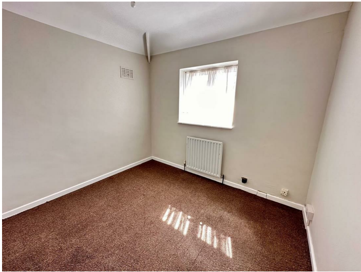
Front aspect window, Radiator, storage cupboard