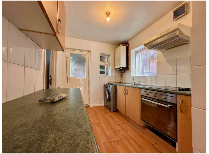
Rear aspect door and window, stainless steel sink unit, work surfaces, eye and base units, wall mounted gas boiler, inset hob and oven, space for washing machine