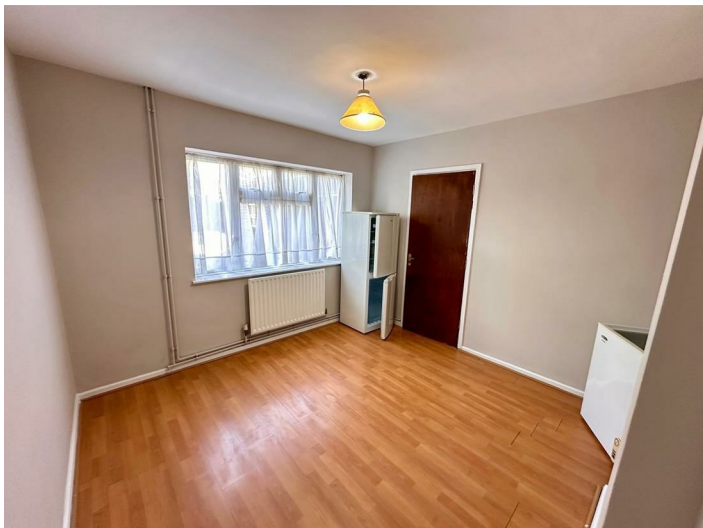
Rear aspect, laminate floor, radiator