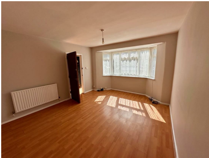
Front aspect bay window, radiator, laminate floor