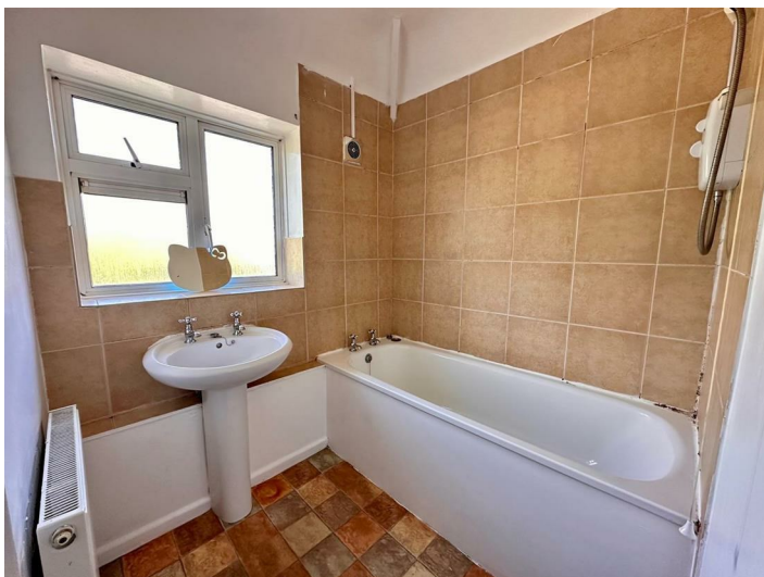
Rear aspect window, white panel enclosed bath with shower, pedestal wash hand basin, radiator, part tiled walls