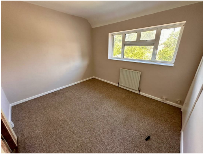
Rear aspect window, radiator, storage cupboard